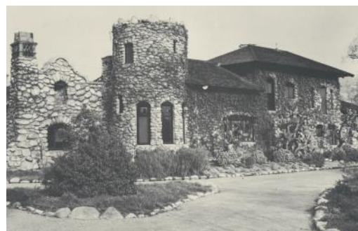
El Alisal, Lummis Home